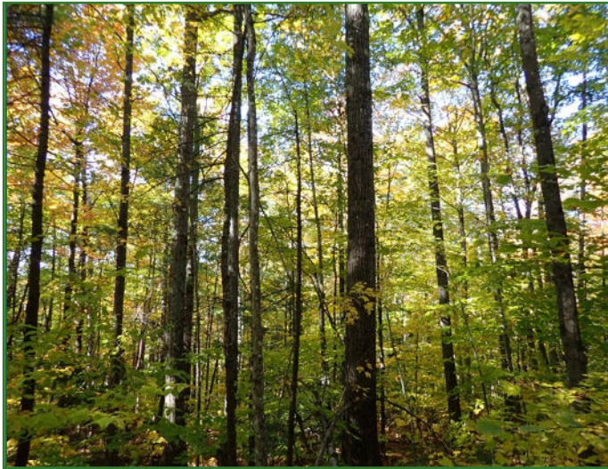
Hardwood sawtimber poised for future growth.

Municipal property taxes are approximately $195 per year. The maps in this report are based on the forest management plan map. Further information regarding the title can be found in the Merrimack County Records Book 1267, Page 432. The property is enrolled in New Hampshire's Current Use, keeping the annual property taxes very low.