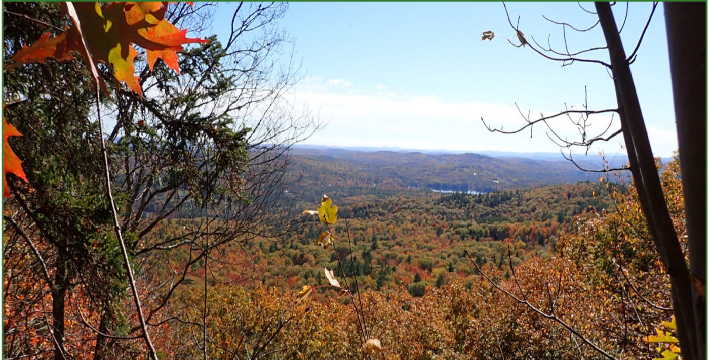
Looking south from vantage point below Tucker Mountain.

Fountains Land is the exclusive broker representing the seller's interest in the marketing, negotiating and sale of this property. Fountains has an ethical and legal obligation to show honesty and fairness to the buyer. The buyer may retain brokers to represent their interests. All measurements are given as a guide, and no liability can be accepted for any errors arising therefrom. No responsibility is taken for any other error, omission, or misstatement in these particulars, nor do they constitute an offer or a contract. We do not make or give, whether in these particulars, during negotiations or otherwise, any representation or warranty in relation to the property.