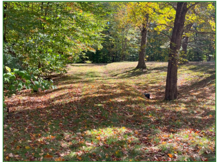
Established R.O.W. provides access from Pieters Road.

Thinning to improve forest health and growth can occur at any time. The property is well poised for a harvest, which could provide immediate cash flow upon purchase. A forest management plan and timber inventory were performed in April 2024. A copy is available upon request. The oak component provides mast for the local wildlife population. Evidence of deer and bear exist throughout the property.