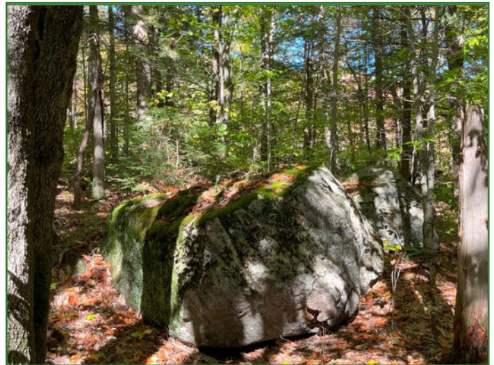
Numerous glacial erratics accent the landscape.