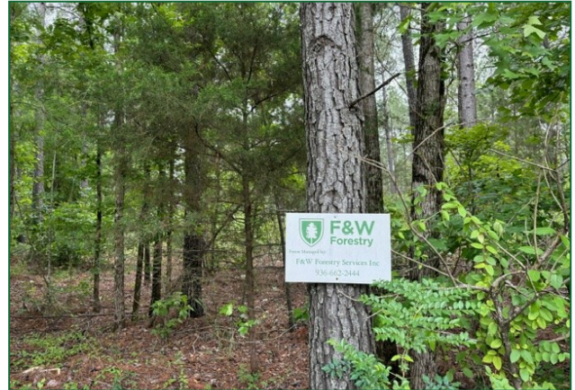
Strickland Acres offers planted pine plantations.

Nestled just on the outskirts of the charming historic town of Waskom, TX, the tracts are positioned perfectly at the intersection of Carthage, TX, Marshall, TX, and Shreveport, LA, forming a unique triangle of scenic beauty .