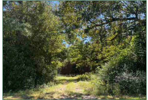
Internal access located on Ferry Lake Road.

The Ferry Lake Prospect property is owned by Monica Smith Hart. The deed is recorded in the Tift County Courthouse in Book 1774 on Page 66. The 2023 tax bills were estimated at $1,438.64.