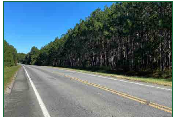
Road frontage on Highway 319.