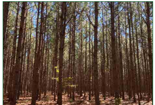
Longleaf planted pine upland sites with annual pine straw income.

The City of Tifton boasts several amenities, such as restaurants, medical offices, grocery stores, and retail shops. Tifton is located along Interstate 75, and access to I-75 is only 4 miles from the property. Tifton is also the home to Abraham Baldwin Agricultural College and the University of Georgia Tifton campus.