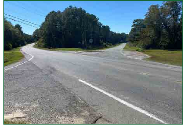
Extensive road frontage on US Highway 319 and Ferry Lake Road.

The rest of the land is composed of natural uplands and hardwood drainages. It is an ideal spot for a rural residential estate or any other development, given its extensive frontage on Highway 319 and Ferry Lake Road.