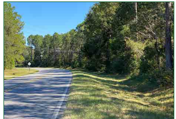
Great access on Ferry Lake Road running the entire north border of the property.

The property is intersected by U.S. Highway 319, a paved public highway, and is bounded on the north by Ferry Lake Road and on the west by New River Church Road, both of which are county-maintained paved roads. The property has 2,450 feet of road frontage on Highway 319, with property on the north and south sides of the roadway. The road frontage on Ferry Lake Road is 2,100 feet, and 1,260 feet of road frontage on New River Church Road.