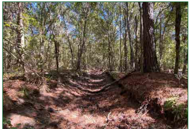
A drainage ditch on the southern portion of the property.

Property inspections shall be done during daylight hours. Seller and Fountains Land in no way make any representations or warranties regarding the conditions of the property, including any and all access routes, and all persons entering upon the property do so at their own risk and accept said property “as-is” in its existing condition during such inspections. All persons entering upon the property assume all risks and liabilities and agree to indemnify, defend, and hold harmless Seller, its affiliates, officers, directors, managers, agents, representatives and employees from and against any and all claims, demands, causes of action, injuries (including death) and damages resulting from any accident, incident, or occurrence arising out of, incidental to or in any way resulting from his or her inspection of the property or his or her exposure to the conditions of the property.