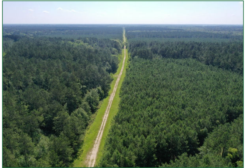
Black Cat Road provides access to the tract.

The owners will convey any interest they have in an additional 193 acres in a separate deed at no additional cost. These additional acres do not have clear title but have been managed as part of the property for years. These acres are identified on the maps provided.