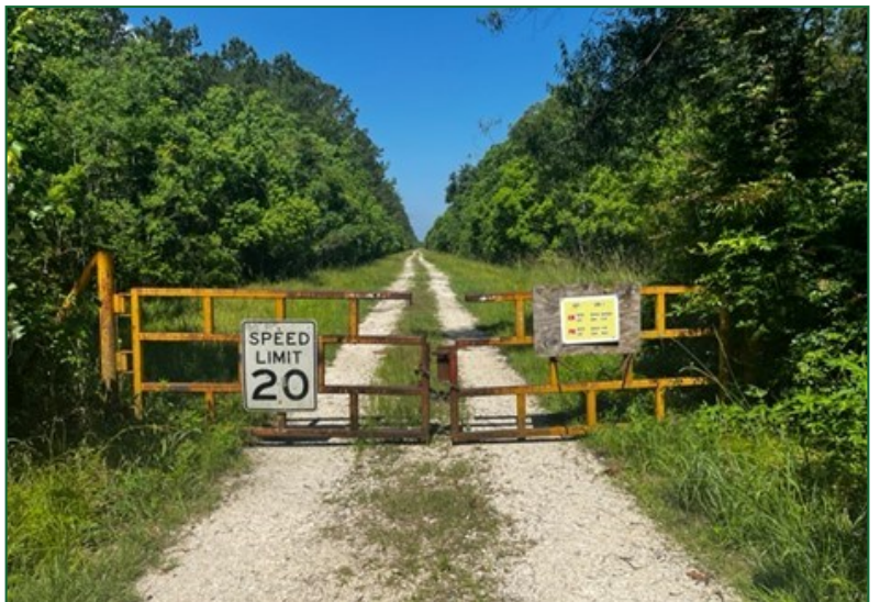
The property features a gated entrance.